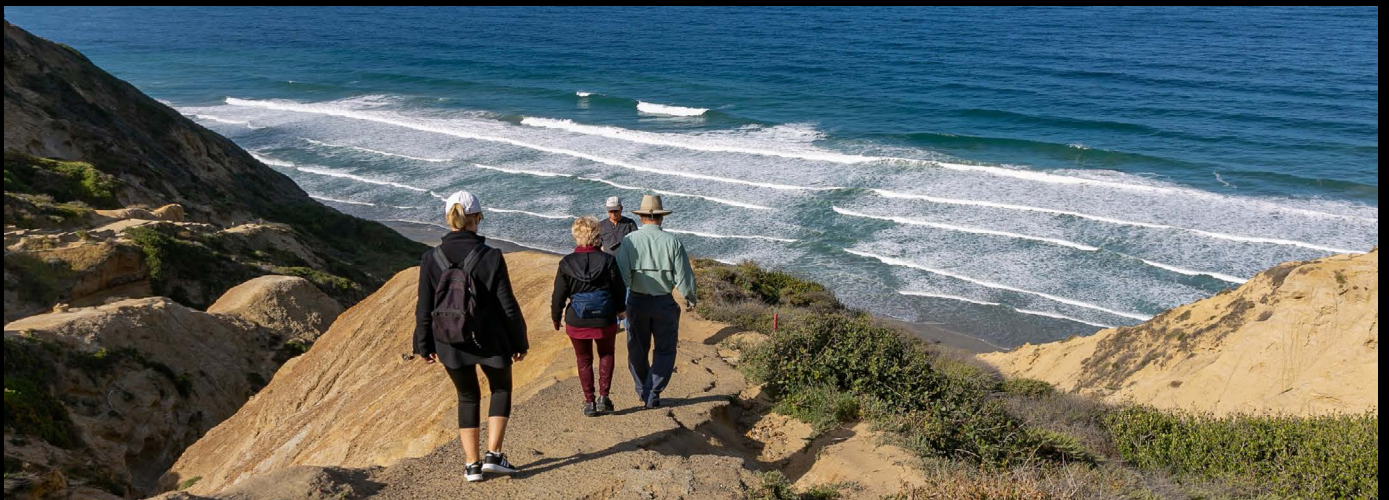
Hiking Black's Beach