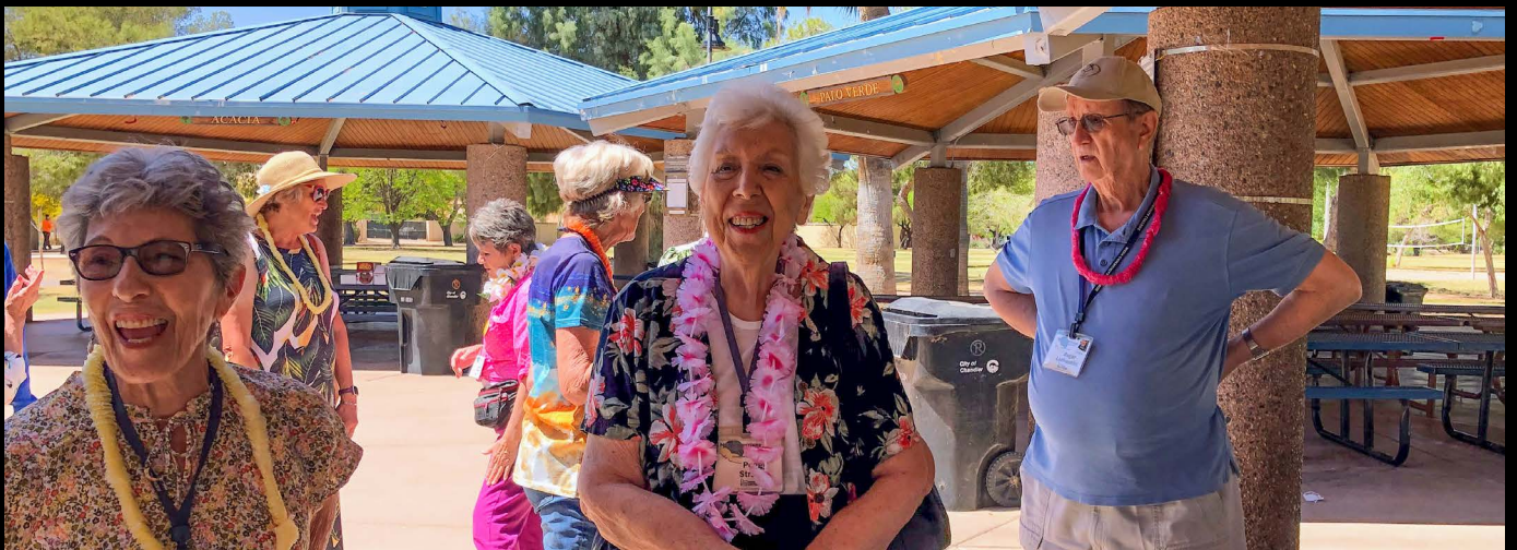
Spring Picnic at Desert Breeze Park