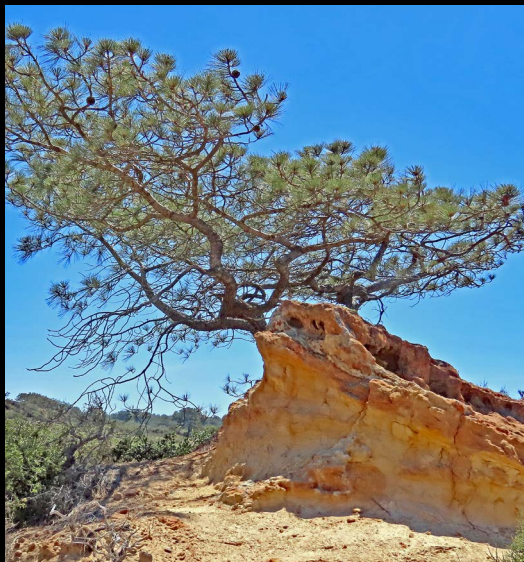
A Torrey Pine