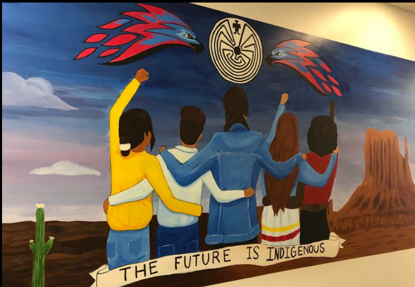
Art Walk MCC Dobson Campus