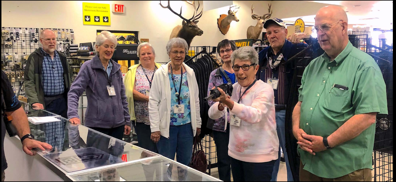
Gun Shooting Class