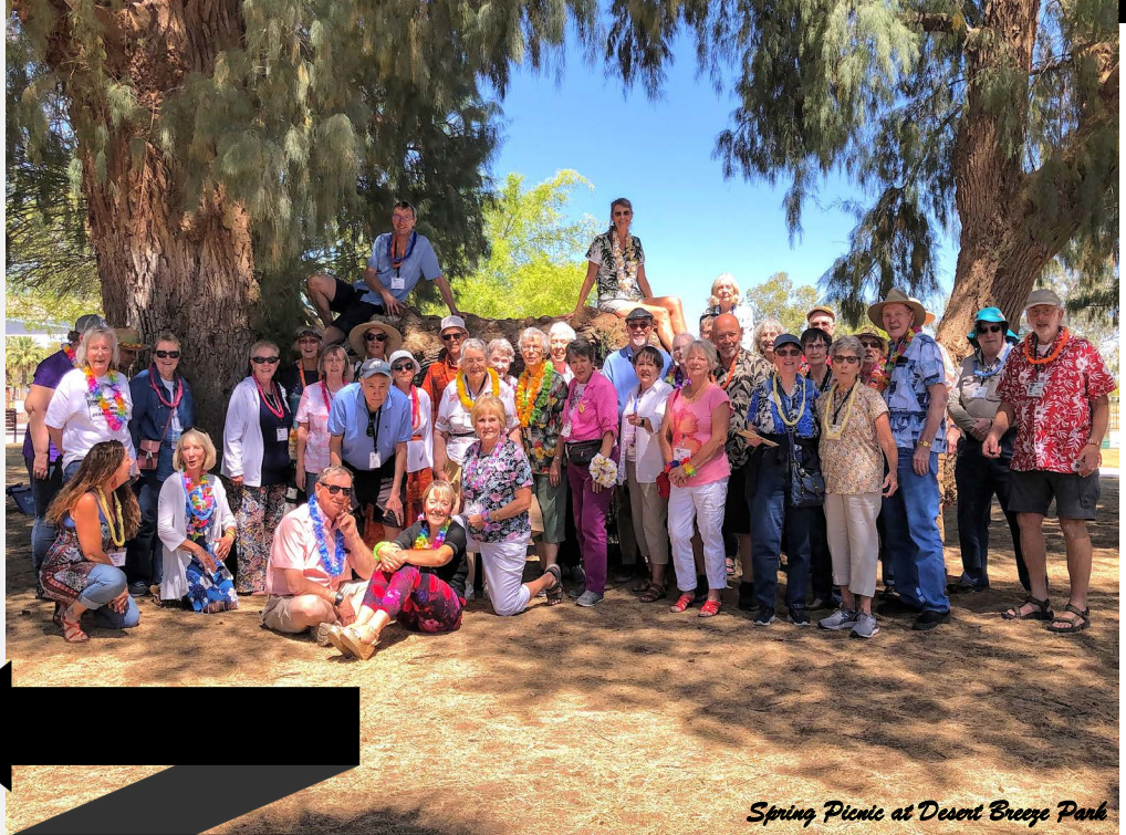
Spring Picnic at Desert Breeze Park