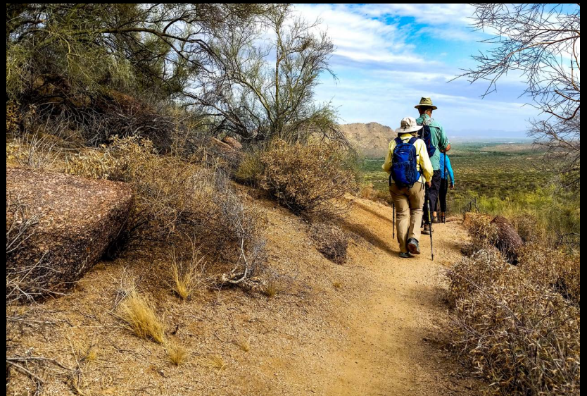
Hiking Twisted Sisters Trail